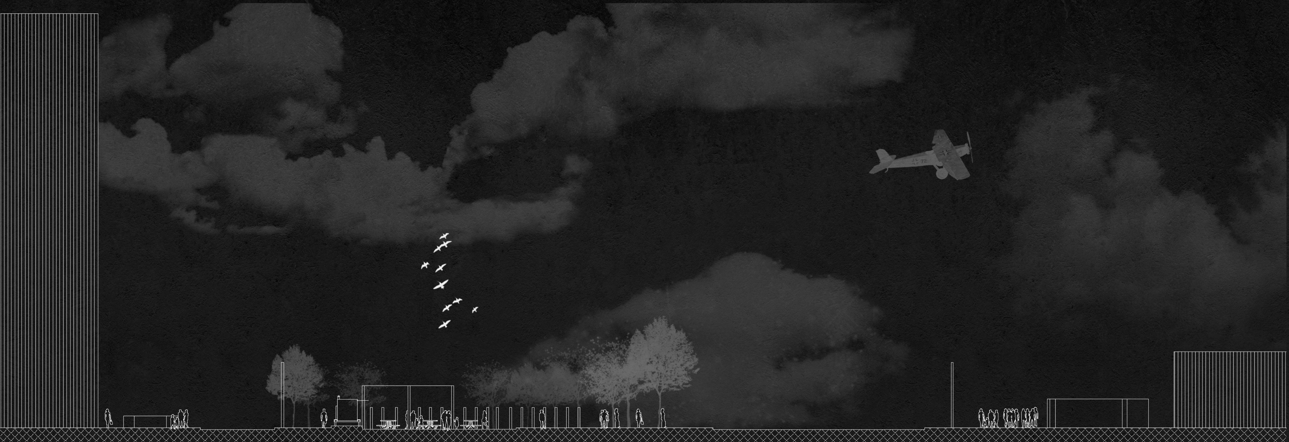
Corte A - A' ESC. 1 : 200