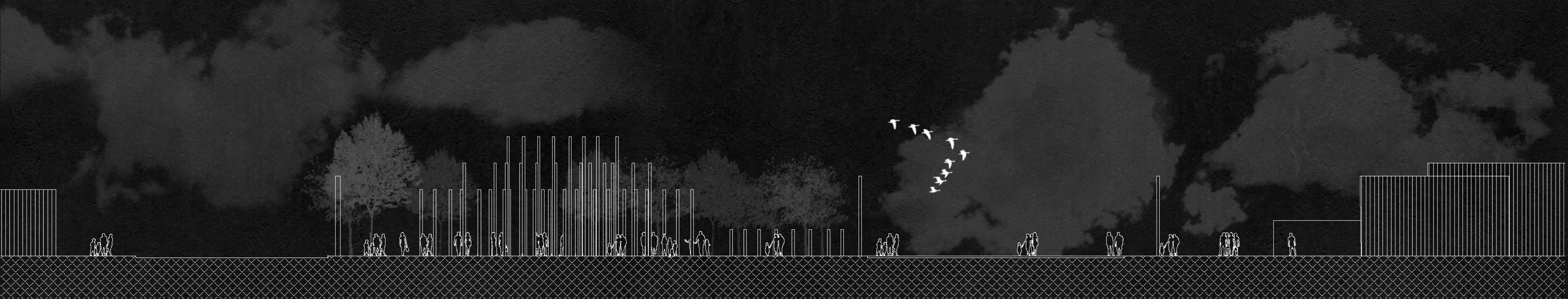
Corte B - B' ESC. 1 : 200