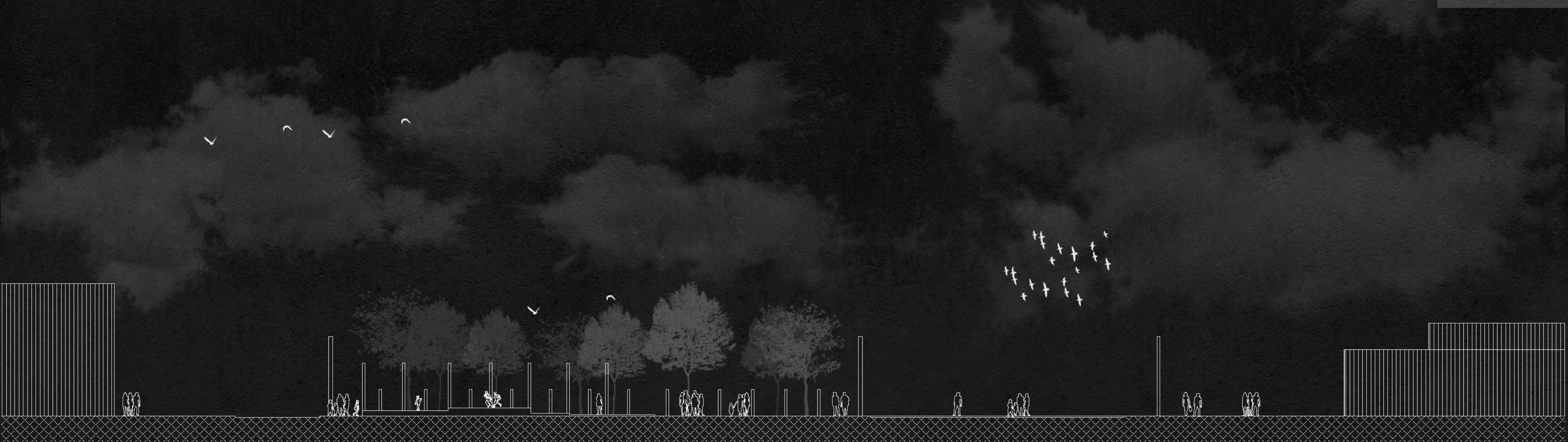
Corte D - D' ESC. 1 : 200