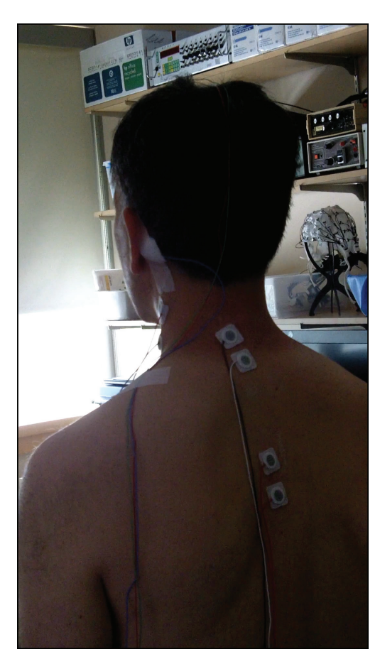
Video 1. Example of Tic. In this video, the patient builds tension voluntarily, but the movement is "involuntary".

The patient feels that he has control of the tension buildup, but the resulting movements to relieve the tension do not occur exactly how he would plan to perform them and he feels he has only partial volition as they occur. While we are unable to determine whether the underlying pathophysiology here is fully similar to that of tics, the evidence points toward tic disorder more than any other movement disorder. At the same time, we recognize the similar phenomenology between organic and functional tics.<sup>8</sup> There are some characteristics of the movement