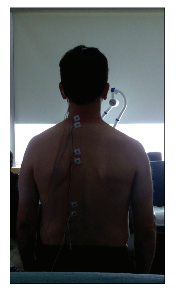
Video 2. Examples of Voluntary Movements. In this video, the patient makes voluntary movements attempting to mimic the tics.