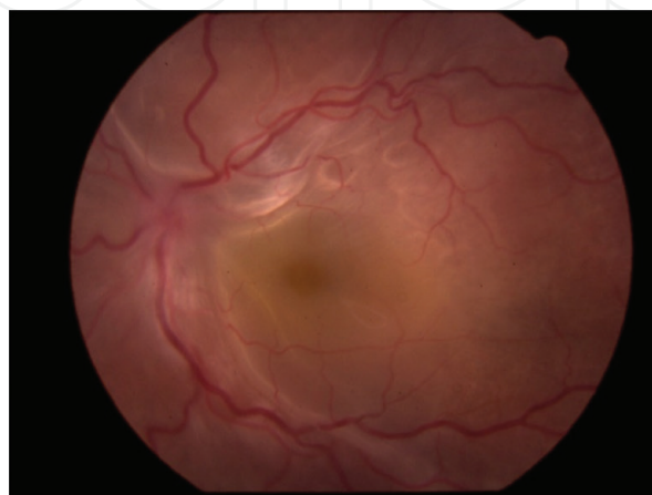
Figure 1. Color fundus photo showing extensive areas of subretinal fluid and bullous serous retinal detachment in a 37-year-old female with VKH.

In addition, integumentary findings may be seen in some patients. In this regard, alopecia, poliosis, and vitiligo are classic signs related to pathological autoimmune response directed to pigmented tissues ( Figure 3 ).