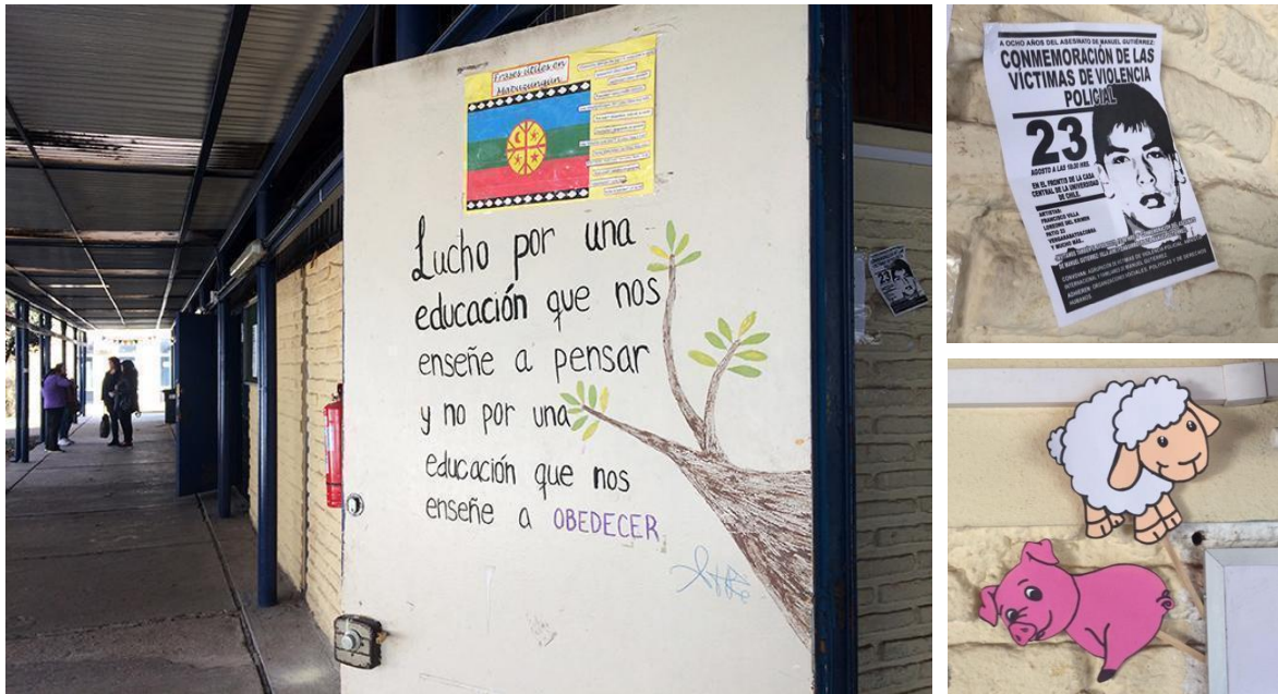
FIGURES 9, 10 AND 11. Primary Education Programme classroom door showing the text 'I fight for an education that teaches us to think and not for an education that teaches us to obey' (Figure 9); a sign calling for 'the victims of police violence' day (Figure 10) and cardboard cut-out drawings of a sheep and a pig (Figure 11).

The interior setting of this classroom reveals an awkward disconnection from the exterior campus' atmosphere. Almost no traces of political or social activism exist, except for certain graffiti on the windows. The typical disposition of desks, in homogeneous lines facing an imaginary 'front' framed by the instructor's desk, only adds to the impression that this standardised classroom is an unusual place to teach how to think 'outside the box' (Figure 12).