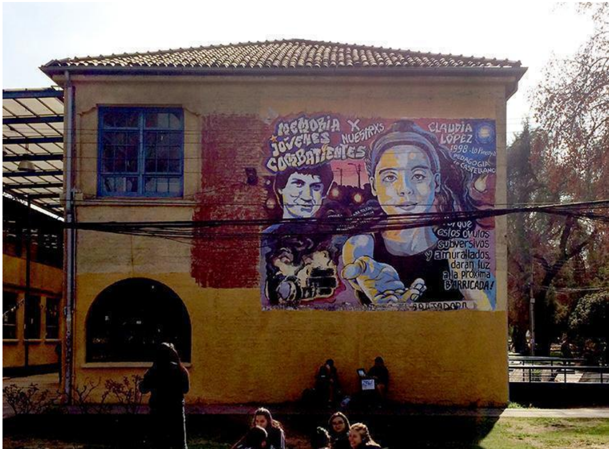
FIGURE 3. Wall mural located in front of Figure 2.

Throughout the external corridors' walls, productive and reproductive techniques overlap in a palimpsest-like style, providing a glimpse into different temporalities and creating a weave where it is difficult to establish the edges of each intervention. Hallways show posters, graffiti and scribbles on their walls. They allude to uprisings, riots, worker-led movements, invitations to gatherings and protests against free trade agreements (Figures 4 and 5). In these graphic interventions, the image maintains its function as a denunciatory device that recovers local memory, promotes social change and calls for protest. The themes are in dialogue with the epic discourses of the large murals in the central courtyard. Still, their peripheral location on the campus, mixed techniques, a less neat spatial organisation and a certain level of deterioration give the discourse a spontaneous, transitory and transgressive tone.