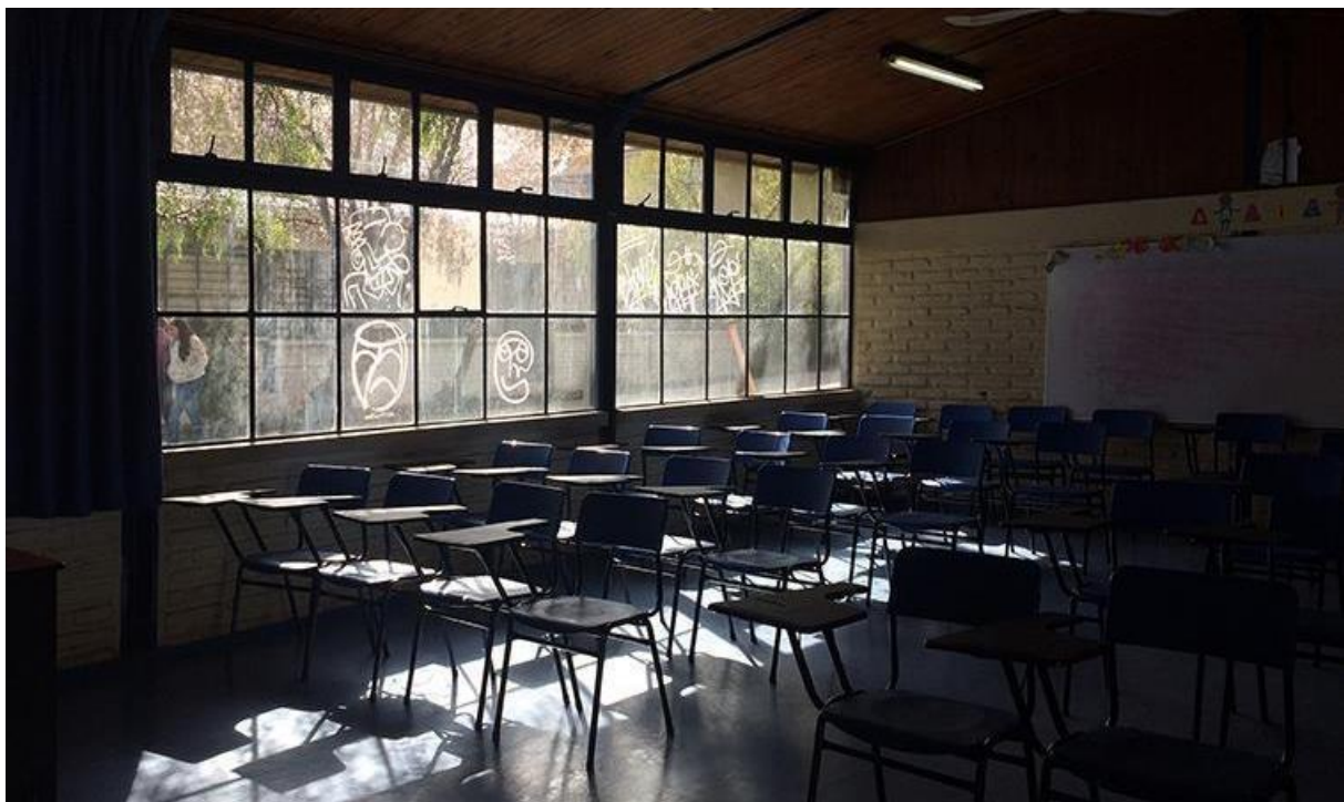
FIGURE 12. Interior of a Primary Education Programme classroom.

The interior setting of this classroom reveals an awkward disconnection from the exterior campus' atmosphere. Almost no traces of political or social activism exist, except for certain graffiti on the windows. The typical disposition of desks, in homogeneous lines facing an imaginary 'front' framed by the instructor's desk, only adds to the impression that this standardised classroom is an unusual place to teach how to think 'outside the box' (Figure 12).