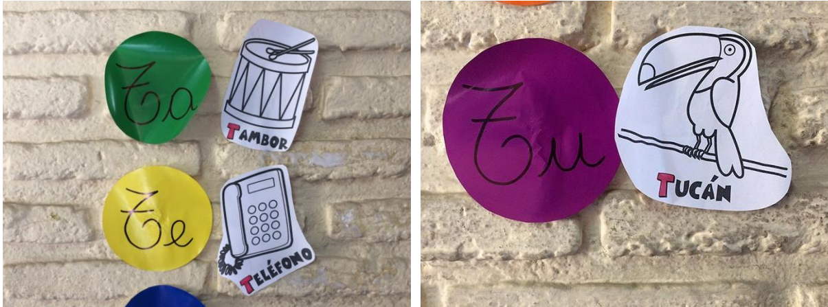
FIGURES 13 AND 14. Literacy methods using images and syllables.

Inside another classroom, visual teaching aids for primary education can be seen where one written syllable is linked to an object that begins with that same syllable (Figures 13 and 14). In Figure 14, the 'TU' [tu] syllable overlaps the sketch of a toucan printed on white paper. It is an image downloaded from a website that offers resources to print and colour (guiainfantil.com, n.d.). Strangely enough, from Chile, one would have to travel at least 2000 miles to be able to see a real toucan.