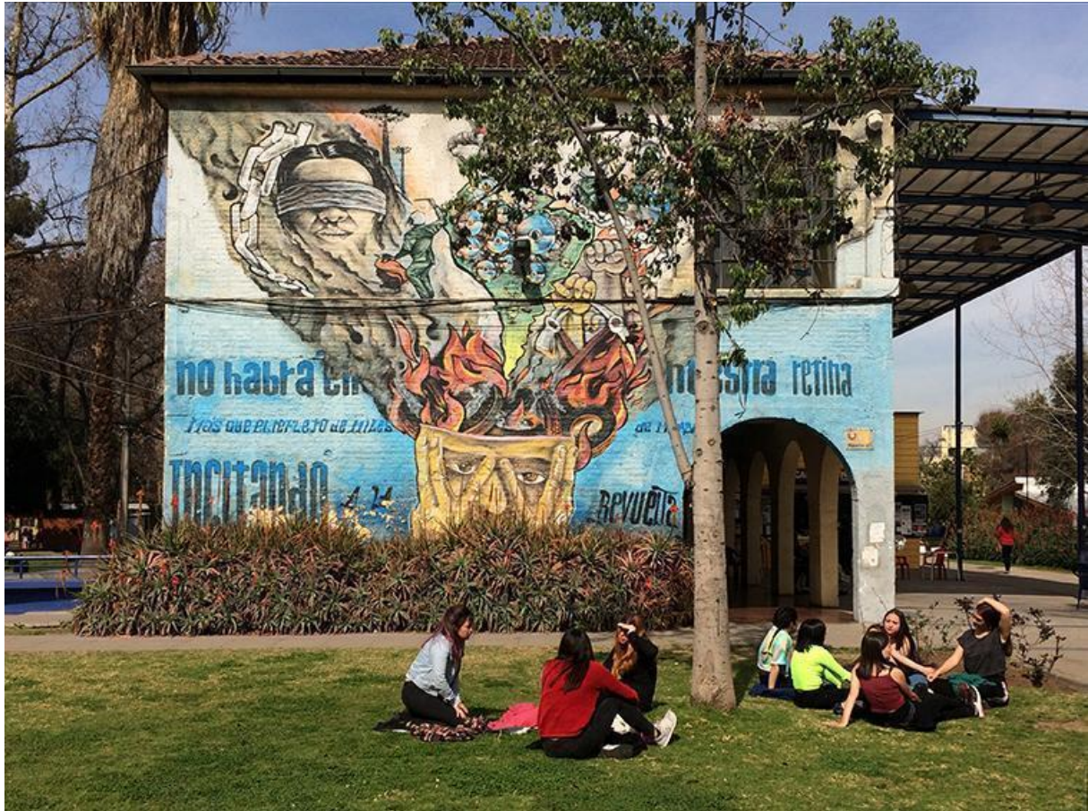
FIGURE 2. Wall mural located south of the main yard.

daring or not to look. Transforming the brain into a burning wheel barricade, fire blends with working-class symbols (clenched fists, chains, gears) over the South American map. The face of a blindfolded indigenous woman emerges from the smoke. At her side, a figure with a helmet swings a truncheon. The text 'There will be nothing in our retina but the reflex of thousands of hands inciting revolt' runs from side to side. The mural reveals the tensions between being able to look and understand reality, the possibility of choosing not to look and the violence of being blinded.