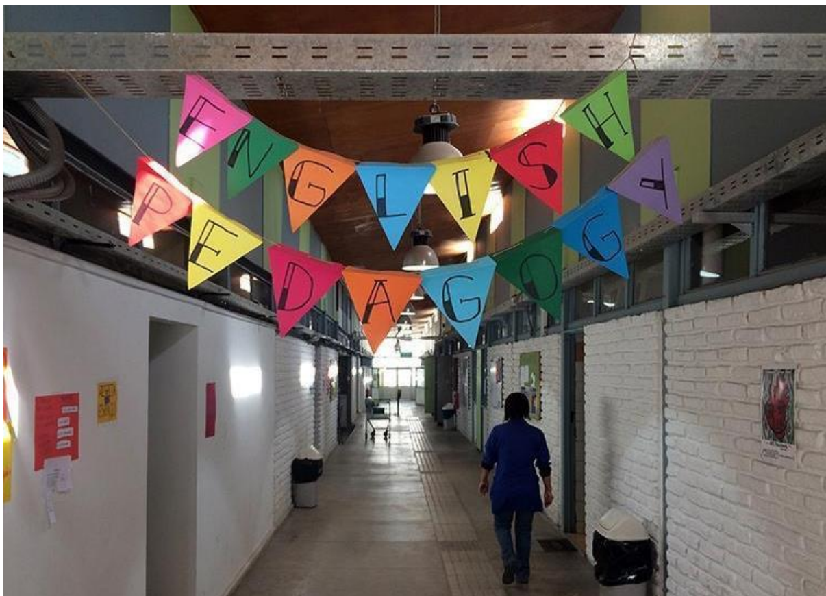
FIGURE 8. Interior corridor of the English Pedagogy school.

In another corridor, one of the classroom doors has a text that reads: 'I fight for an education that teaches us to think and not for an education that teaches us to obey'. Such a critical message contrasts with the Mapuche flag surrounded by a list of pre-made and stereotyped useful phrases in this native language (Figure 9). The Mapuche represents 90% of the indigenous population in Chile (Ibáñez-Salgado & Druker-Ibáñez, 2018). Inside the classroom, a sign calling for a day of remembrance for 'the victims of police violence' can be seen, whereas at a short distance, cardboard cut-out figures of a sheep and a pig recall the iconography of children's products (Figures 10 and 11).