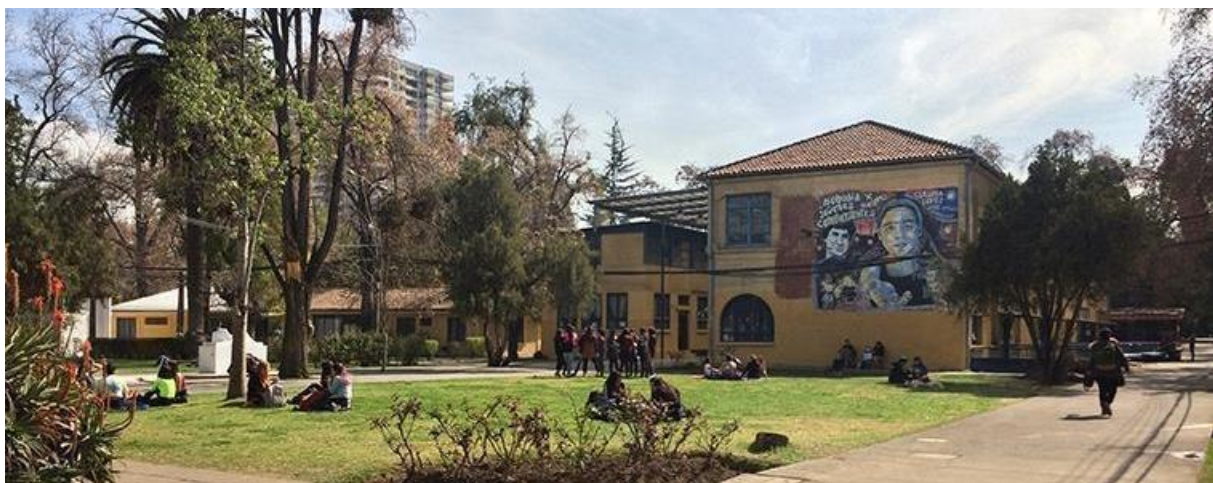
FIGURE 1. The central courtyard of the campus connects two buildings that display murals with political themes.

This university has occupied the same campus for over half a century. It is located in a central sector of Santiago de Chile and comprises independent buildings of up to three floors that house classrooms, offices, laboratories and auditoriums. Courtyards, gardens and corridors connect the different areas of the campus and offer a meeting place for students during class breaks and free time (Figure 1). Walking around the campus is a visual experience due to the considerable number and variety of images displayed on the walls: large murals covering the facades of certain buildings, graffiti, advertisements, decorative elements and visual teacher aids in classrooms. The themes, sizes and techniques of the images are equally varied and are strongly related to their location.