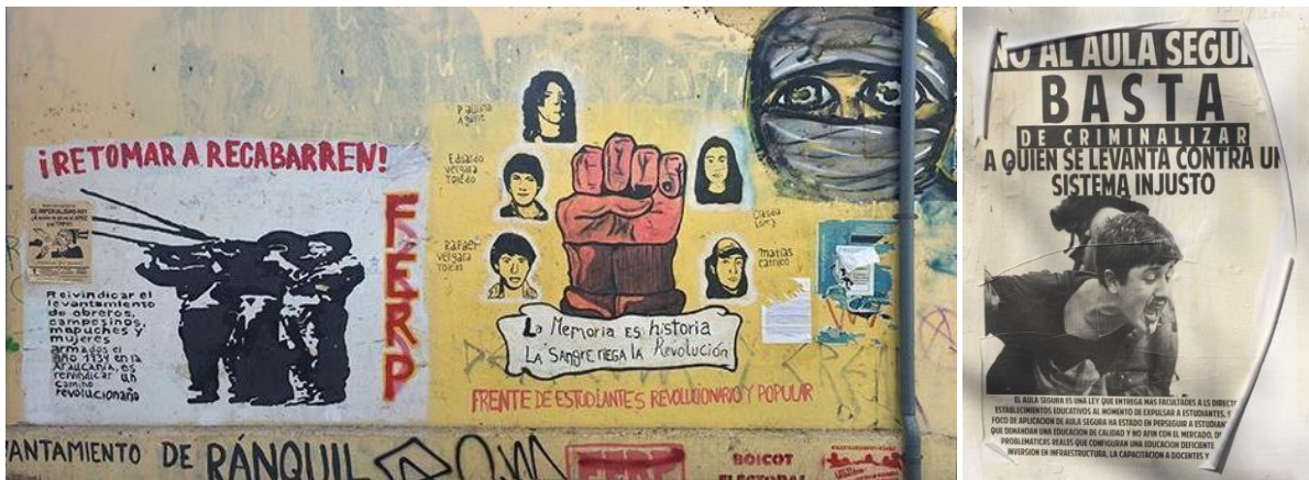
FIGURES 4 AND 5. Graphic interventions. Mural paints (Figure 4) and a poster stuck on corridor walls (Figure 5).

The external walls of the Primary Education Programme classrooms exhibit paintings of strange characters that catch attention. The first one evokes street art graffiti (Schacter, 2016). It has its face covered and carries a science book and a coloured Molotov cocktail (Figure 6). The other figure resembles a child with an inexpressive face, which could be a mask, and legs that grow into scissors. It plays a violin and is surrounded by a sun and a moon. Although it combines habitual childhood imagery, it is somewhat grotesque and evokes creatures with malevolent traits (Figure 7).