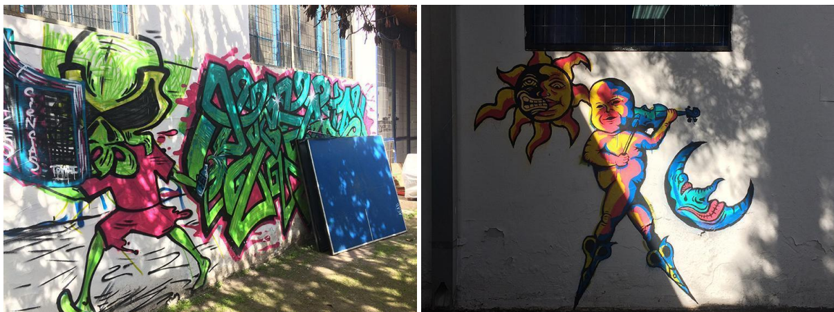
FIGURES 6 AND 7. Painting on the walls of an interior courtyard. A character carrying a science book and a coloured Molotov cocktail (Figure 6) and a strange character playing the violin (Figure 7).

The external walls of the Primary Education Programme classrooms exhibit paintings of strange characters that catch attention. The first one evokes street art graffiti (Schacter, 2016). It has its face covered and carries a science book and a coloured Molotov cocktail (Figure 6). The other figure resembles a child with an inexpressive face, which could be a mask, and legs that grow into scissors. It plays a violin and is surrounded by a sun and a moon. Although it combines habitual childhood imagery, it is somewhat grotesque and evokes creatures with malevolent traits (Figure 7).