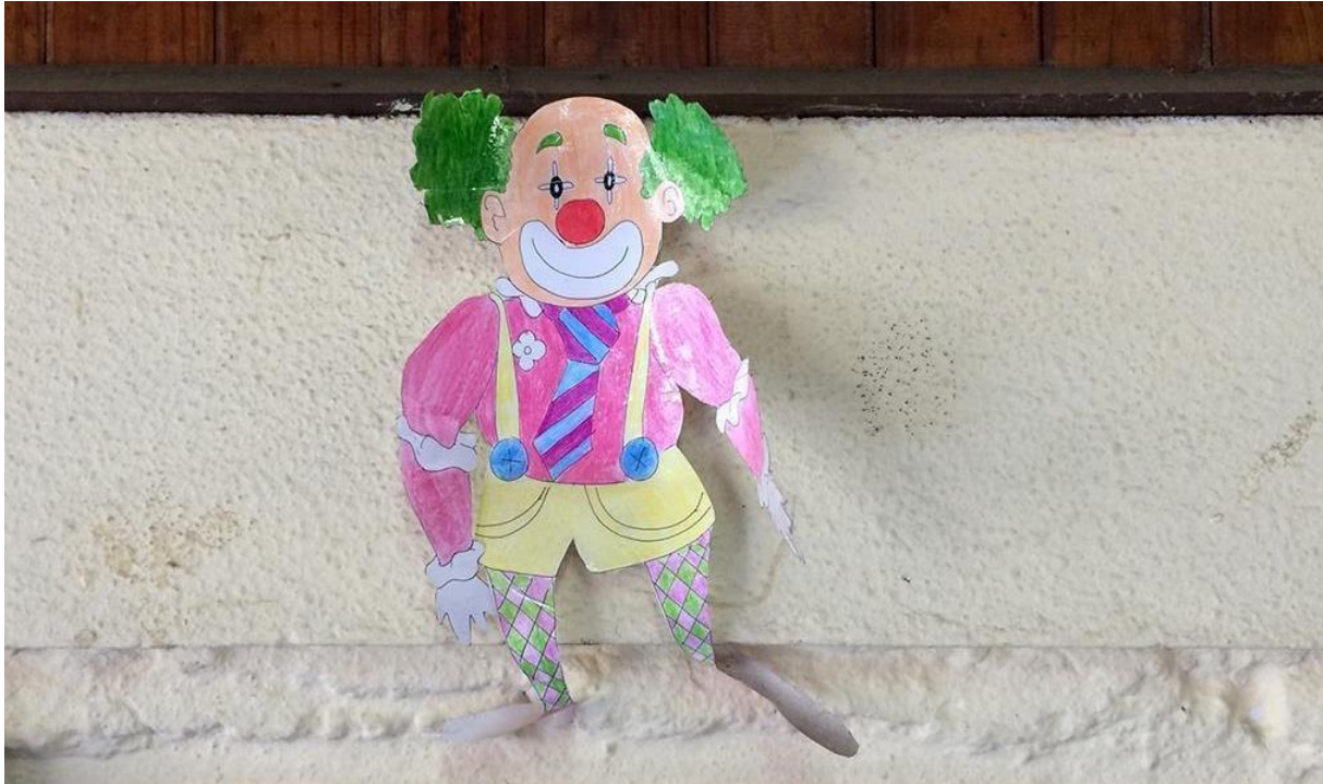
FIGURE 15. Figure of a clown drawn, coloured and cut out on paper.