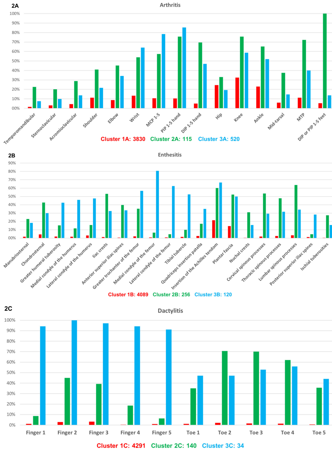
Figure 2 Distribution of the location of peripheral involvement across clusters with regard to the arthritis (A), enthesitis (B) and dactylitis (C). DIP, distal interphalangeal joint; PIP, proximal interphalangeal joint; MTP, metatarsophalangeal; MCP, metacarpophalangeal.

256 and 120 patients, respectively). Cluster 1B showed a very low prevalence of enthesitis (figure 2B) but, if present, they were more frequently located at the Achilles tendon and plantar fascia (ie, heel enthesitis). Clusters 2B and 3B showed a high prevalence of enthesitis, with a predominant involvement of axial locations in cluster 2B and peripheral locations in cluster 3B.