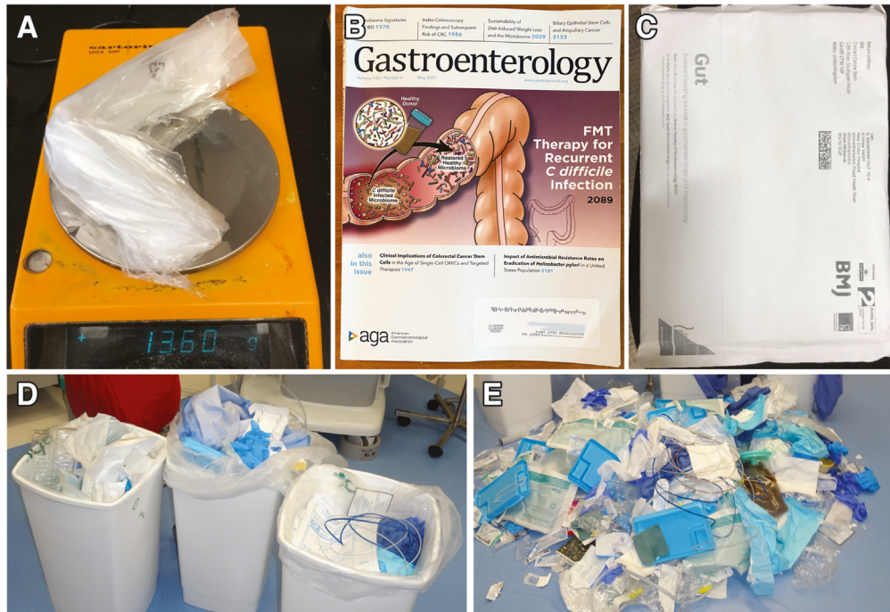
Figure 2. Conversion of plastic journal covers to paper, and waste generated by endoscopy procedures. (A) The plastic covers of 2 typical journals weigh 13.6 g; (B, C) Some of the major GI journals have switched from using plastic covers to either paper labels ( Gastroenterology ) or a paper cover ( Gut ). (D) Three bins of endoscopy-generated waste from an endoscopy unit in Melbourne, Australia (for 9 colonoscopies with polypectomies and 1 upper endoscopy, excluding the suction and drainage tubing and canisters). The bins shown in (D) were then weighed after emptying their contents (E). The net weight of waste per procedure was 0.54 kg.

as The Medical Society Consortium, which includes 19 society members. 25 We believe that individual GI member societies can act locally and think globally and can be highly effective, given that the needs and resources vary widely across and even within countries. As such, GI societies can be involved directly and indirectly with almost all of the specific efforts, and so can endoscopy centers, GI practices, academic centers, publishers, and individuals (Table 1). In general terms, the efforts revolve around reducing the level of greenhouse gas emissions, curbing nonrecyclable waste, and working toward developing affordable, climate-friendly, substitute disposables.