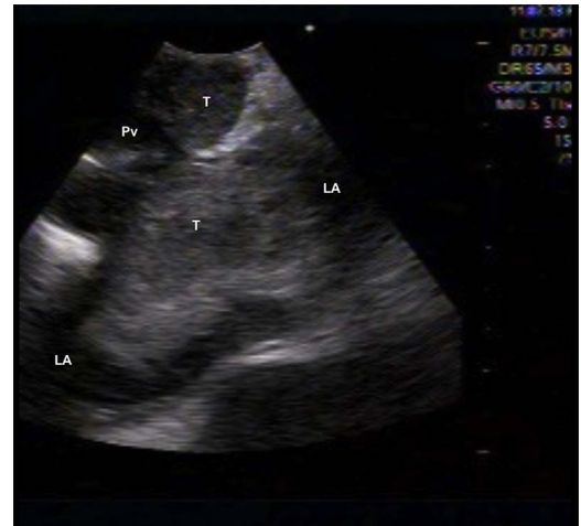
Figure 2 Convex-probe endobronchial ultrasound image demonstrating echogenic 30 mm tumour, along the right pulmonary vein extending into the LA (LA, left atrium; Pv, pulmonary vein; T, tumour).

Convex-probe endobronchial ultrasound (CP-EBUS) identified a vascularised 30 mm lesion, along the right pulmonary vein extending into the LA ( figure 2 ). Needle aspiration was performed to the described mass and to the subcarinal lymph node. Both biopsies results were positive for lung adenocarcinoma, immunohistochemistry showed positive thyroid transcription factor-1 (TTF-1), molecular analysis demonstrated a negative epidermal growth factor receptor (EGFR) and echinoderm microtubule-associated protein-like 4-anaplastic lymphoma kinase (EML4-ALK). The patient started chemotherapy, anticoagulation and localised radiotherapy in her right hip. Cardiac metastasis of lung cancer usually involves the pericardium or epicardium by direct invasion and/or lymphatic spread, however metastasis to the LA myocardium and endocardium are extremely rare. 1