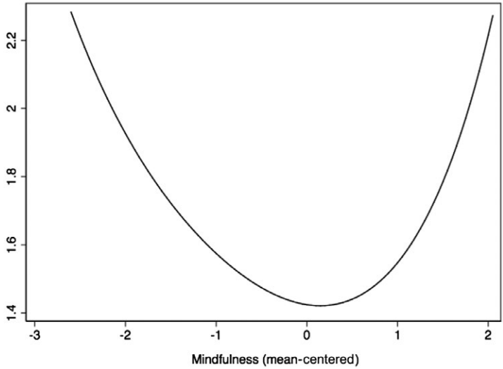
Figure 2 The Effect of Mindfulness on the Count of Gestation Activities for Individuals with and without Prior Entrepreneurial Experience (Predicted Count)