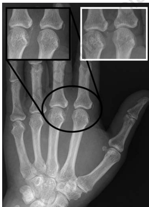
Figure 2 - Right hand anteroposterior radiograph with zoom in the region of interest. Calcific tendinopathy of the first and second dorsal interosseous tendons at first control (black box). Follow-up radiograph at 4 months, with partial reabsorption of the second dorsal interosseous muscle calcifications (white box).

Four months from the onset of symptoms the patient persisted with pain in the index finger. Follow up radiographs were performed, which showed a decrease in calcification size in relation to the base of the proximal phalanx of the middle finger, without significant changes in calcification in relation to the base of the proximal phalanx of the index finger (Figure 2).