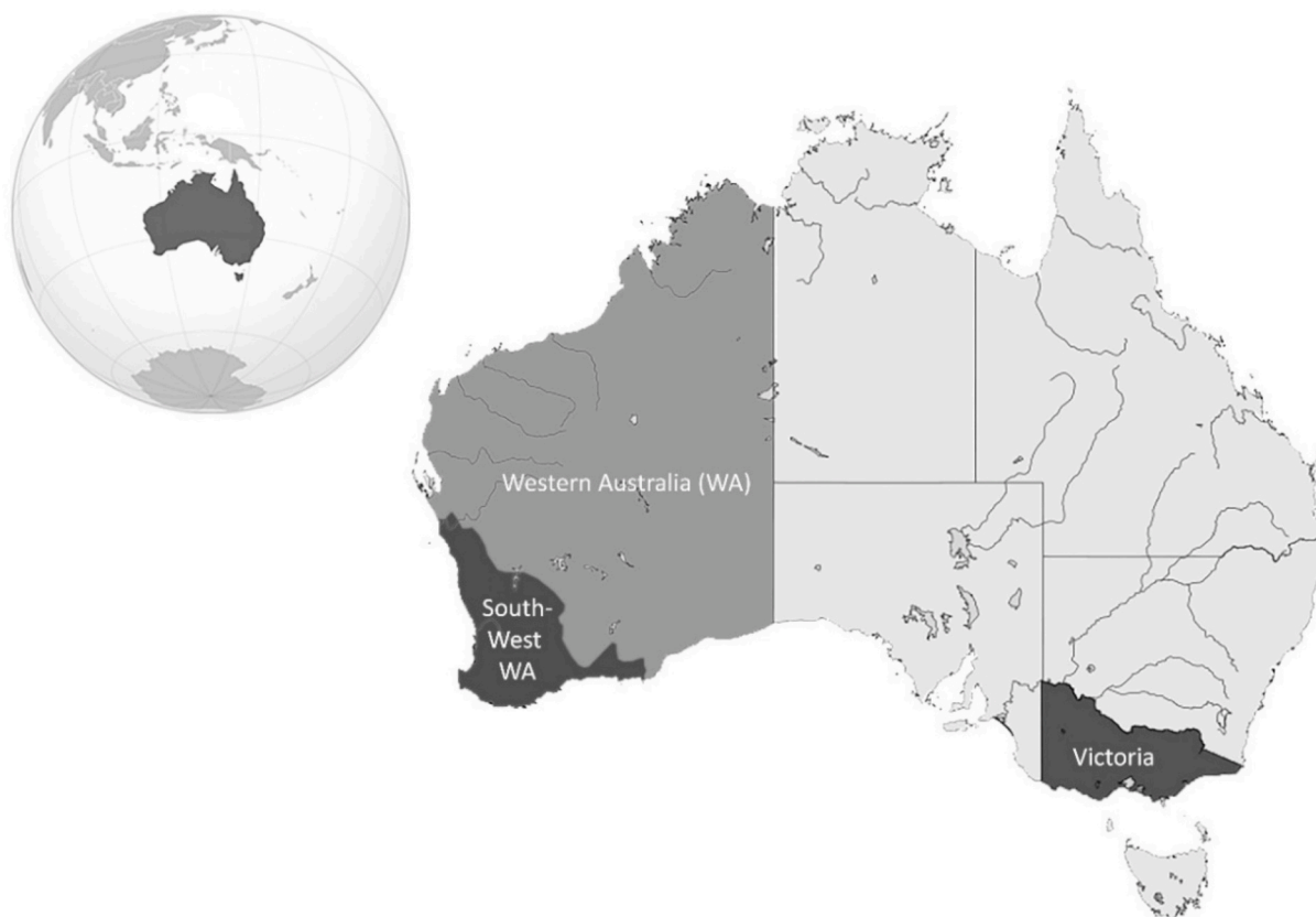
Fig. 1. Map of Australia and the States of WA and Victoria.

events [38,39]. Since the 1960s, the fire regimes of south-west WA have been dominated by prescribed burns of low to moderate intensity with decadal frequency, with occasional high-intensity wildfires [40]. WA has not historically experienced the same extent of wildfire devastation as Victoria, however, past wildfire events such as the Dwellingup fires (1961) and the more recent Waroona Fires (2016) demonstrate the propensity of extreme wildfires in the area with potentially catastrophic impacts.